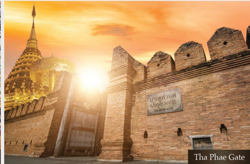
Tha Phae Gate