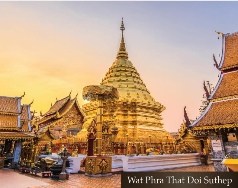
Wat Phra That Doi Suthep