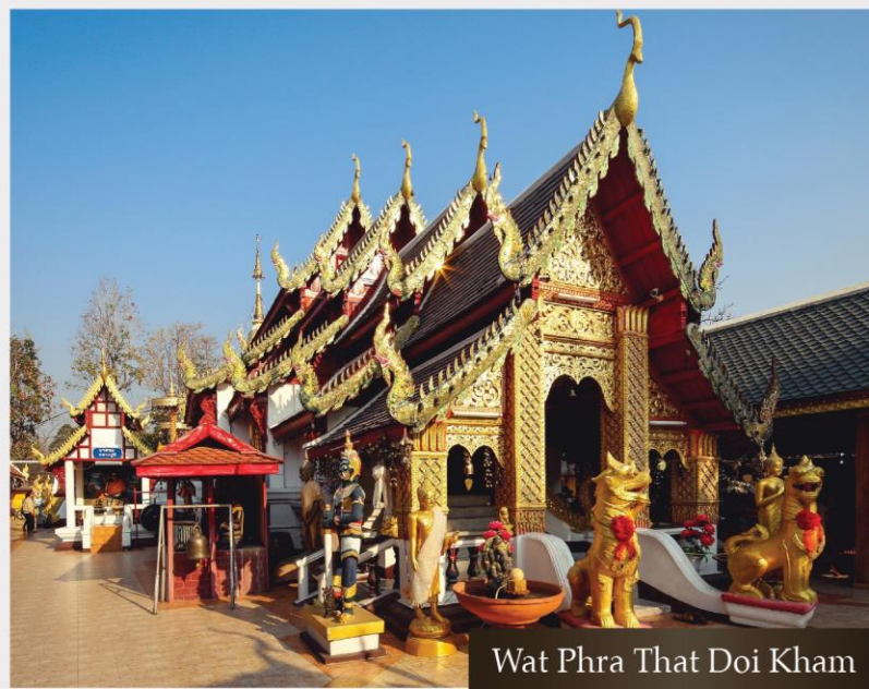
Wat Phra That Doi Kham