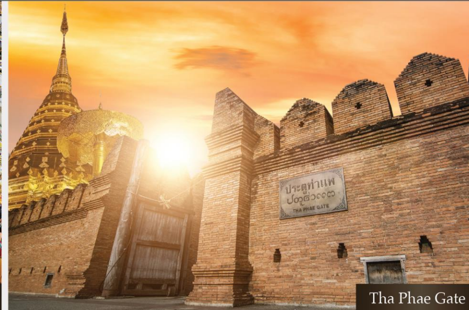
Tha Phae Gate