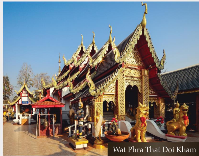
Wat Phra That Doi Kham