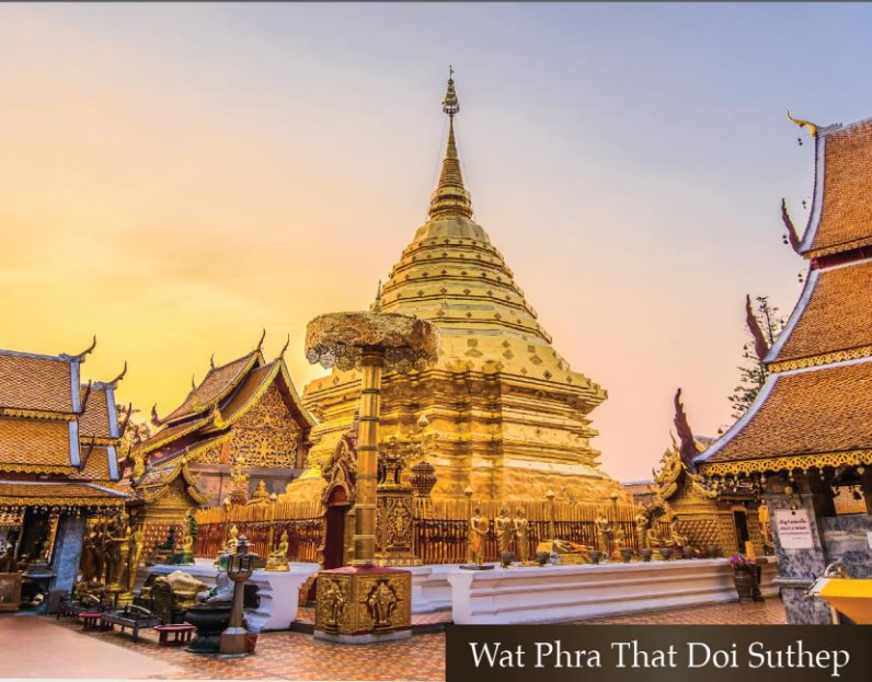
Wat Phra That Doi Suthep