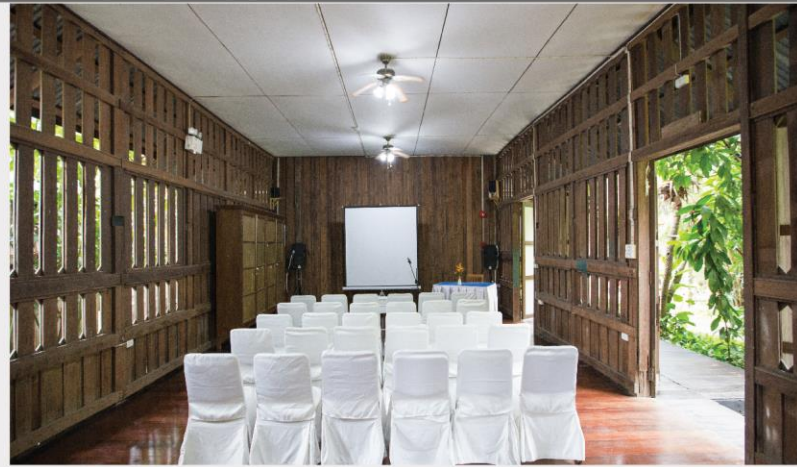
2 FLOOR MEETING ROOM