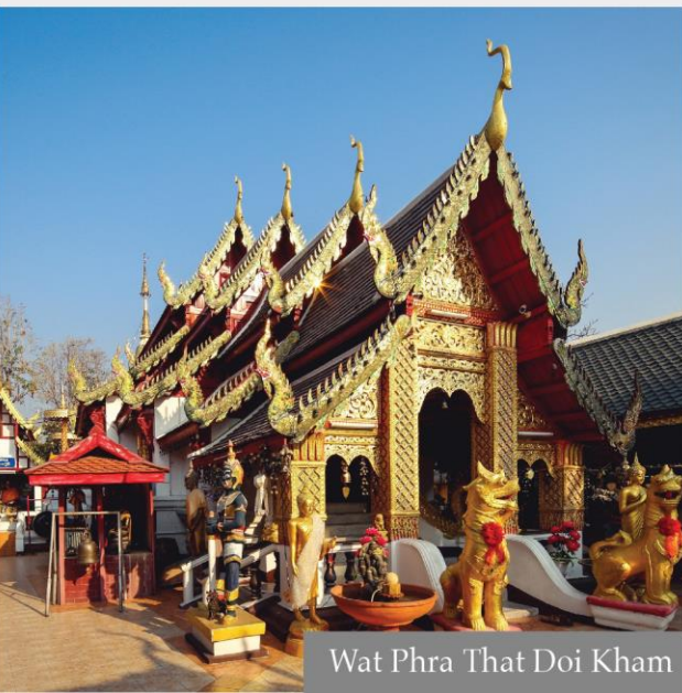
Wat Phra That Doi Kham