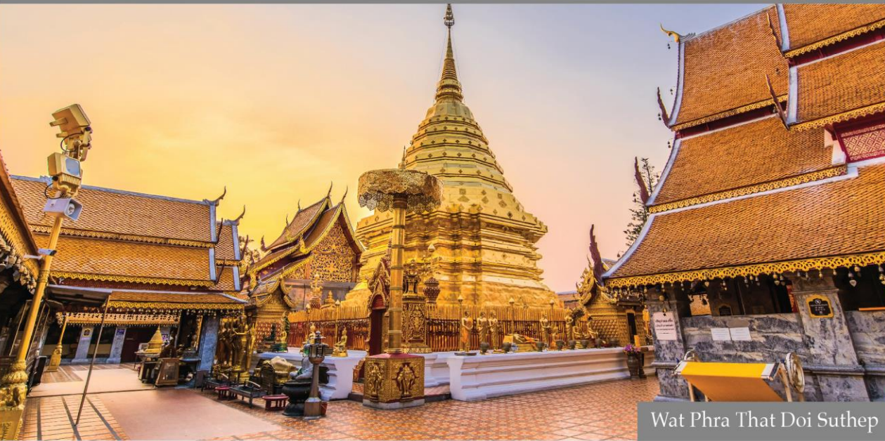
Wat Phra That Doi Suthep