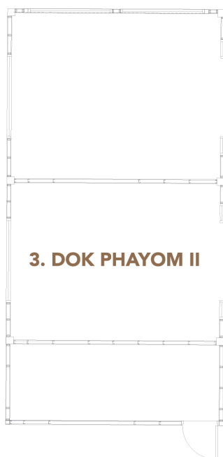
3. DOK PHAYOM II