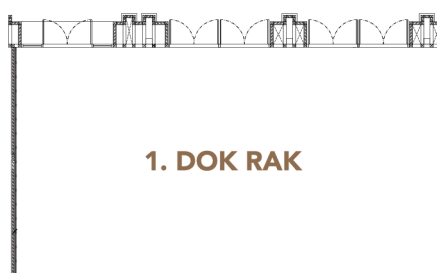
1. DOK RAK