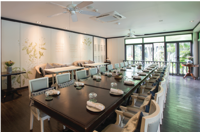
DOK PHUD BAR