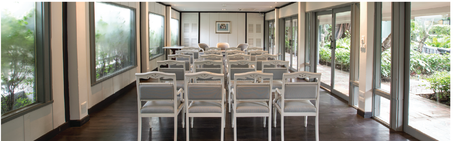
DOK PHAYOM I