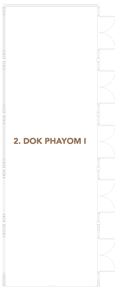
2. DOK PHAYOM I