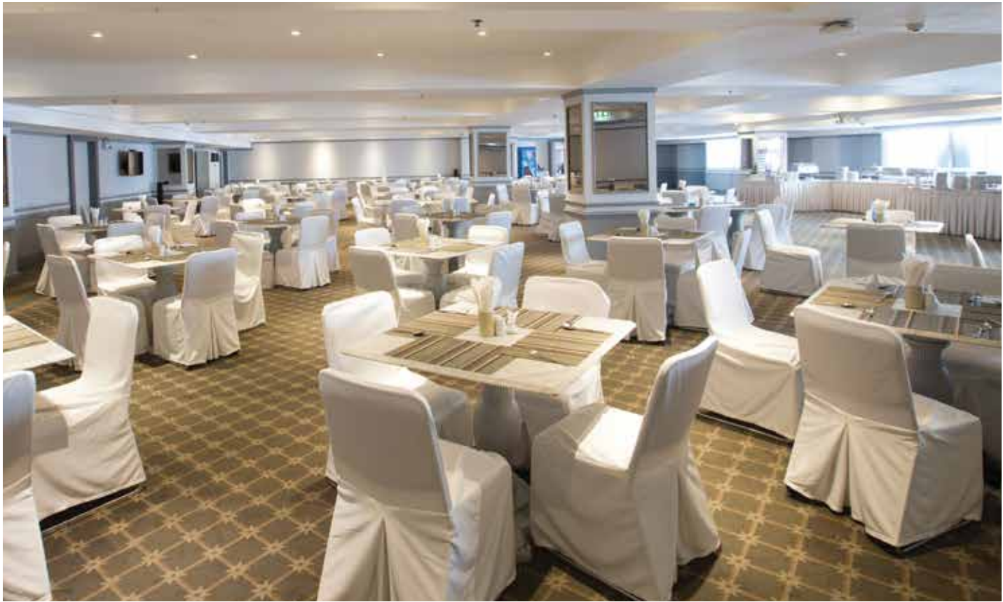
THE PANTIP RESTAURANT